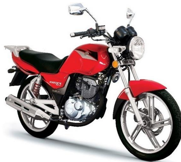
GSR 125 2013/2015