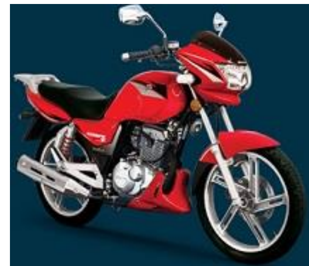
GSR 125 S 2013/2014