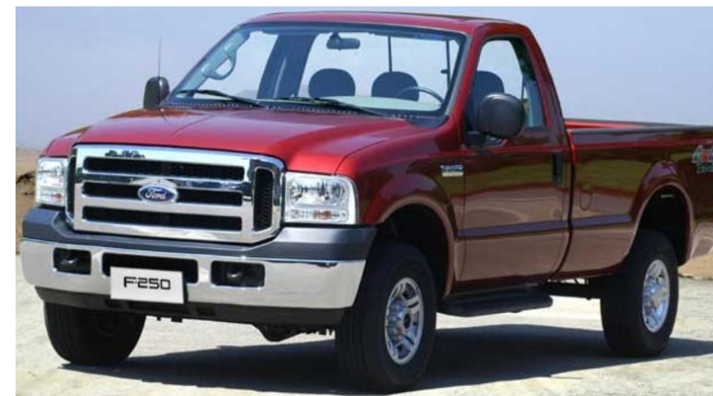
F250 CAB. ESTENDIDA