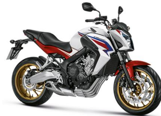
CBR 650F 2015/2015