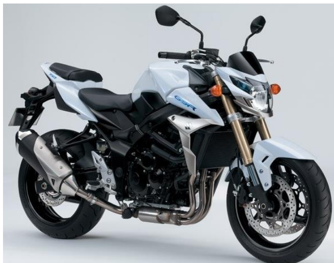
GSR 750 2014/2015