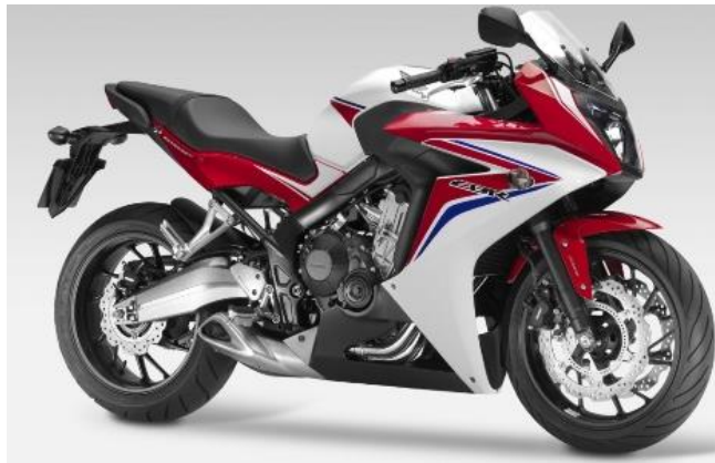
CBR 600F 2014/2015